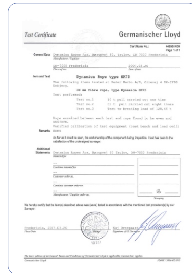
Breaking strength certificate - Mills / 3rd Party on request