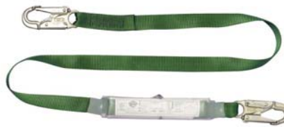
Single webbing lanyard